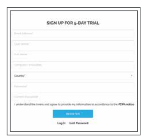
Fill up the free trial Registration Form